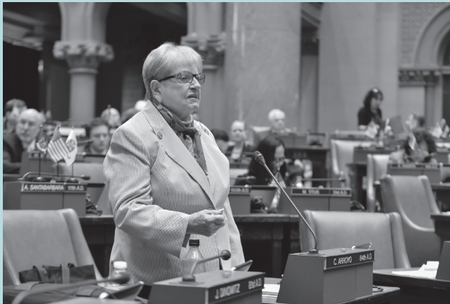
Assemblywoman Carmen Arroyo remarks on the floor of the New York State Assembly during vote on education funding.

http://assembly.state.ny.us/comm/PRHisp/20151029/index.pdf