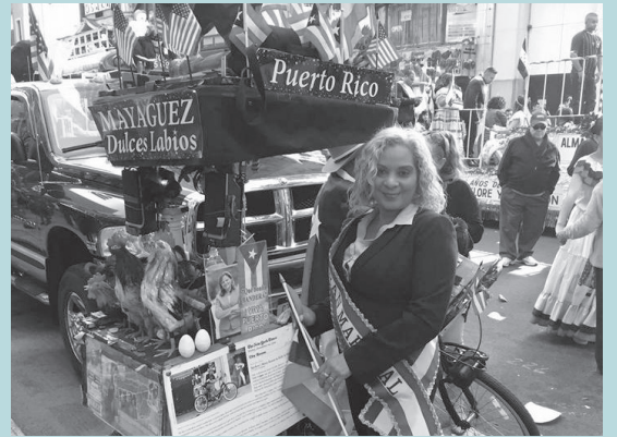
Assemblywoman Maritza Davila visits a vendor with island crafts during the annual Puerto Rican Day Parade.