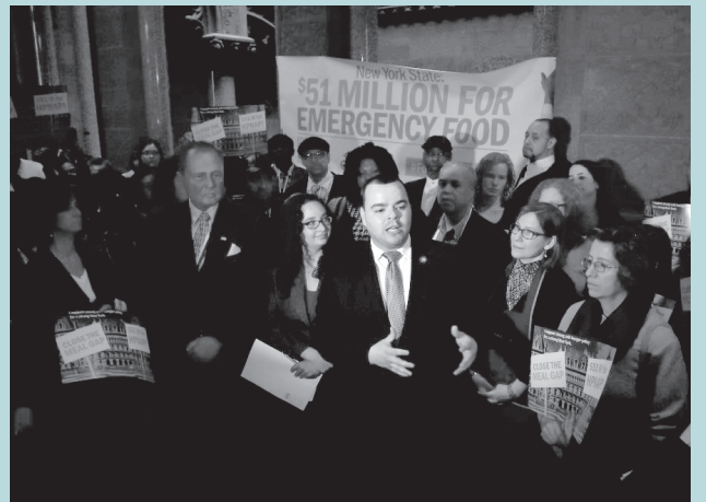
Assemblyman Crespo joins advocates from throughout the state to call for additional funding for emergency food programs.