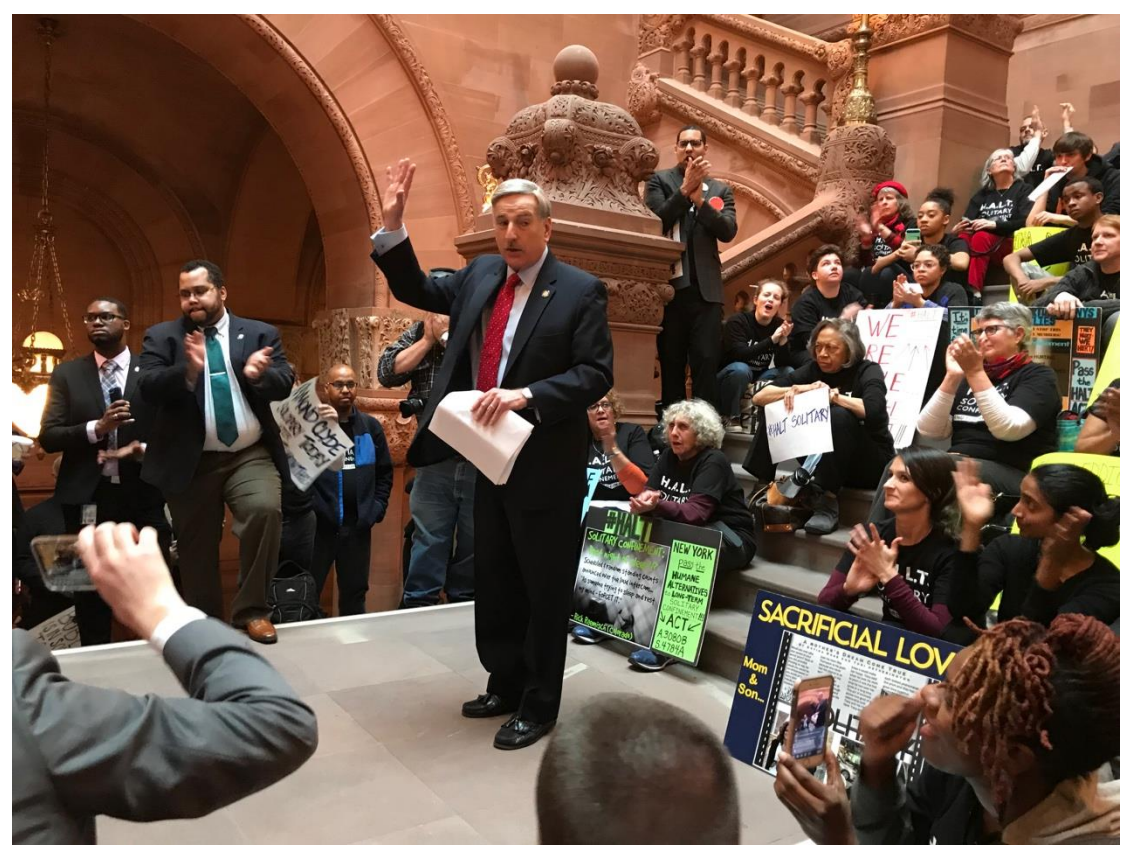
Committee Chairman David I. Weprin and Assemblymember Victor Pichardo at a solitary confinement rally.

confinement of vulnerable people, and restrict the criteria that can result in such confinement, improve conditions of confinement, and create more humane and effective alternatives to such confinement. The Committee will again advance these bills for consideration in 2019 and will continue to consider other bills to limit SHU time in New York State.